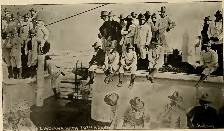
LEAVING THE GOLDEN GATE—GOOD-BY TO NATIVE LAND.